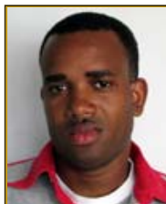
Victor Morgan Hospitality Stores